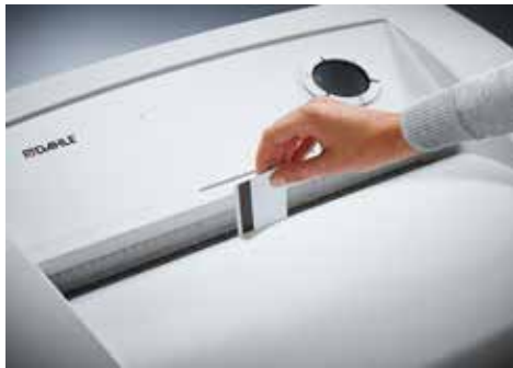
Dahle Waste 116 document shredder