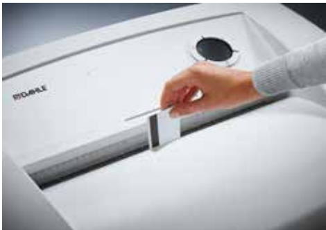
Dahle Office 416air document shredder