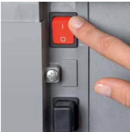
Separate main switch is located on the rear of the document shredder and completely disconnects it from the mains power supply